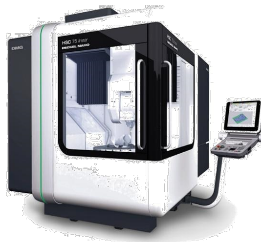
Fig. Milling center for 5-axis simultaneous machining [ISF] .