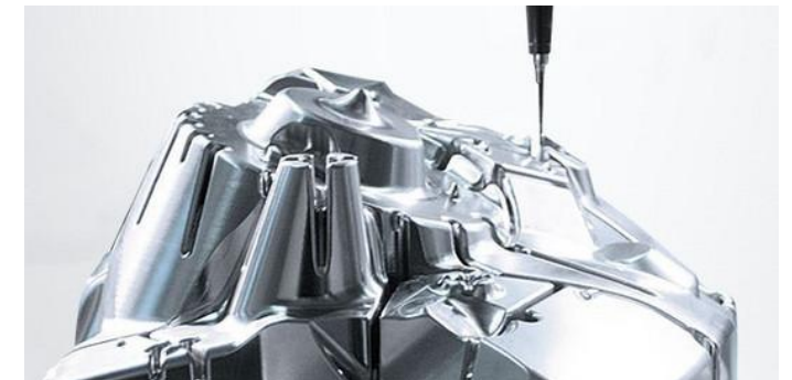
Fig. Milling process for machining of Die-Casting Mold Inserts [ISF] .